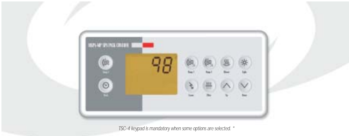
TSC-4 keypad is mandatory when some options are selected. *